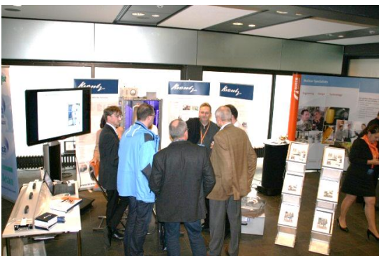
Discussions at the booth of Krantz Filter Systems and Dampers