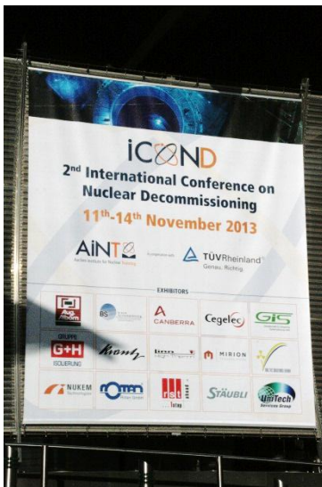
Conference Center „Eurogress“, Aachen (Germany)

At the exhibition booth of Krantz Filter Systems and Dampers the visitors got information regarding online re-cleanable filter systems and other components for HVAC systems during decommissioning of nuclear facilities. Many new and interesting contacts were made and existing business relations were updated.